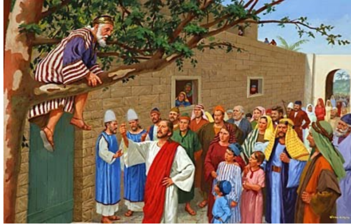
Zacchaeus, the Tax Collector