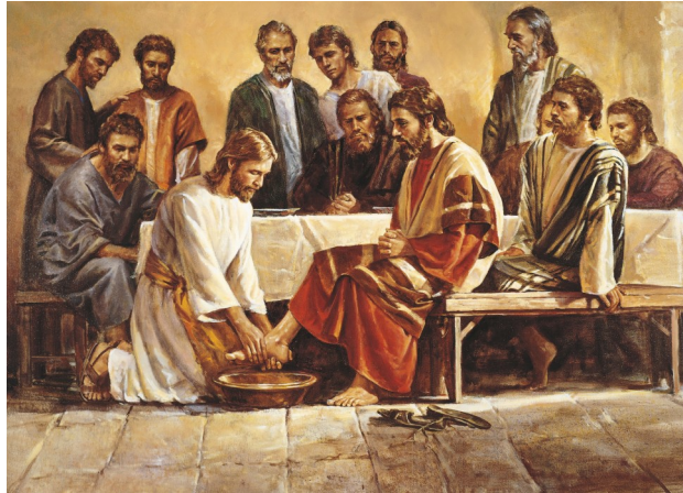
Jesus Washes The Disciples Feet